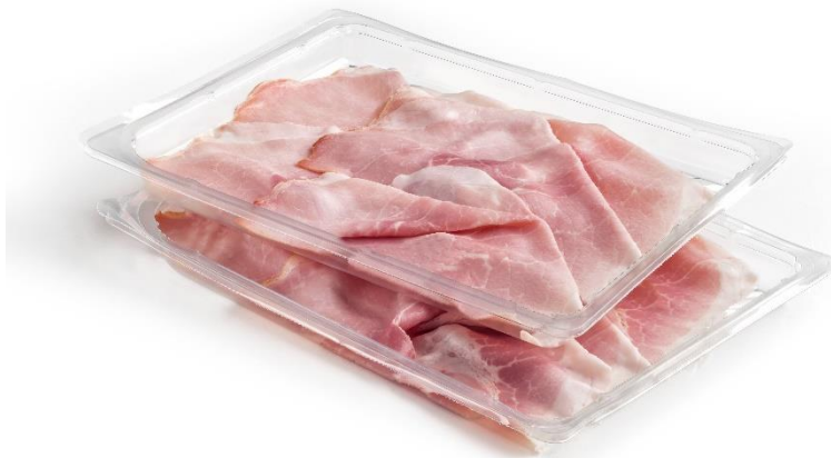
[Image 3] Caption / source: EVAL EVOH barrier films from Kuraray enable sustainable and efficient meat packaging.